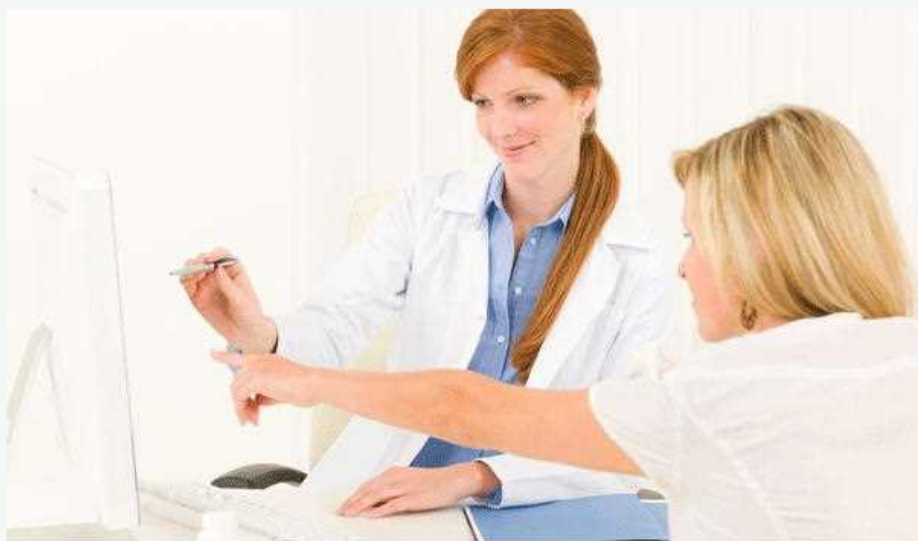
HemorrhoidsInternal HemorrhoidsHeal HemorrhoidsExternal

This can be done by setting up a bath tub with warm water and letting the patient sit there for 10-15 minutes. The effect is due to the healing feeling induced by the warm water while the patient's hips and bottom are usually submersed in it.