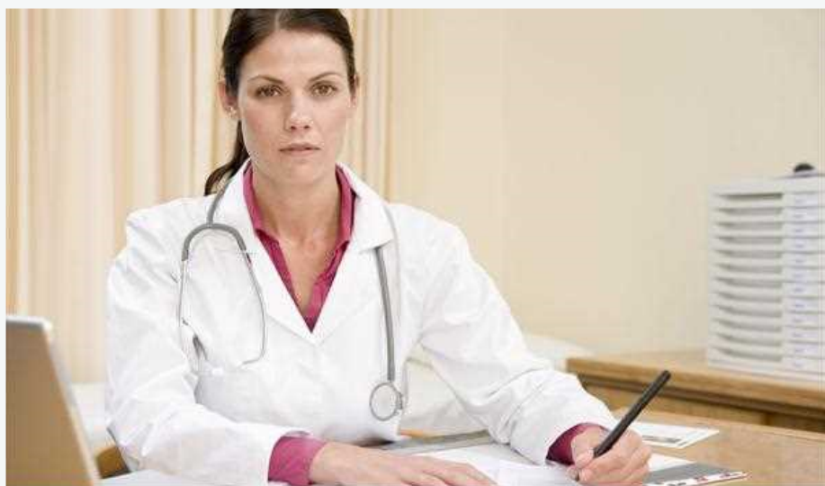
HemorrhoidsHemorrhoidHemorrhoid RemediesInternal HemorrhoidsHemorrhoid