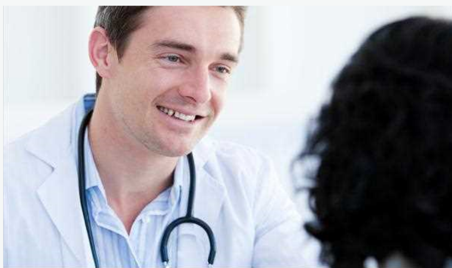
HemorrhoidsInternal HemorrhoidsHemorrhoidInternal Hemorrhoid

This will help relieve the itch of internal hemorrhoids while providing treatment for your internal hemorrhoids as well. Ointments containing calamine as well as zinc oxide are also typically suggested for use. Whether or not you use these products internally or externally, you can use them six times in the course of any given twenty-four hour time period. It is important to note that no elements have been given the FDA's seal of approval for internal use to ease some of the more common symptoms of hemorrhoids.