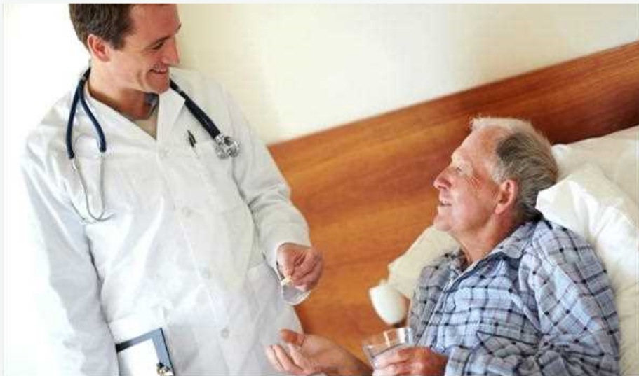
HemorrhoidsHemorrhoidHemorrhoid TreatmentPainful Internal