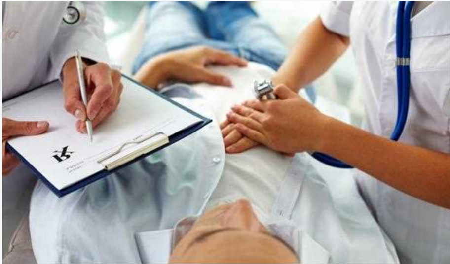
HemorrhoidPilesPiles TreatmentHemorrhoid TreatmentPileHemorrhoids